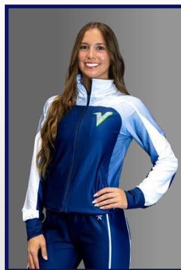
CheerVille Warm Up (optional)